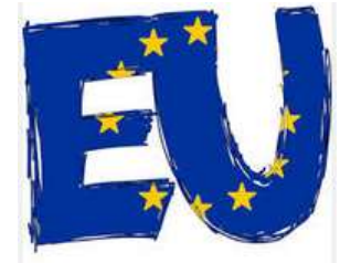
The European Economic Area